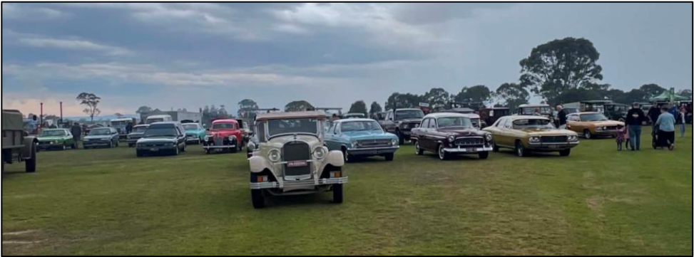
Heyfield Vintage Machinery Rally