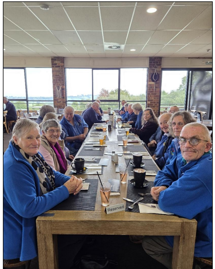
Classic Chicks Lunch at Neerim South Hotel in May.

A renewal form is provided on page 4 of the May issue.